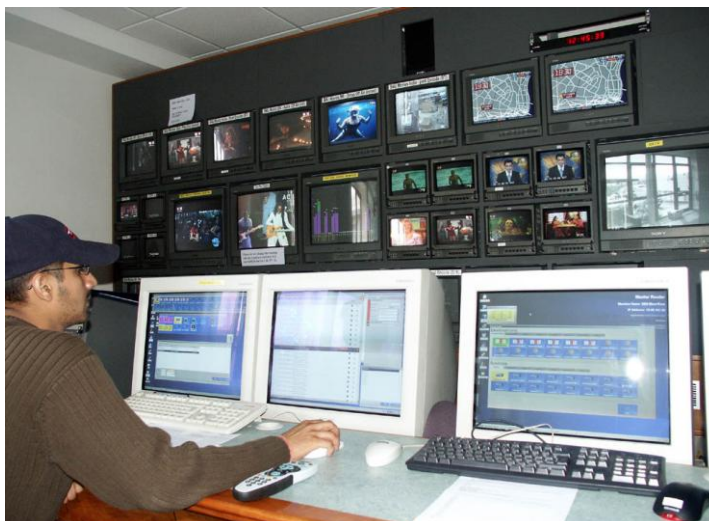
Pharos playtime automation in use at ABS